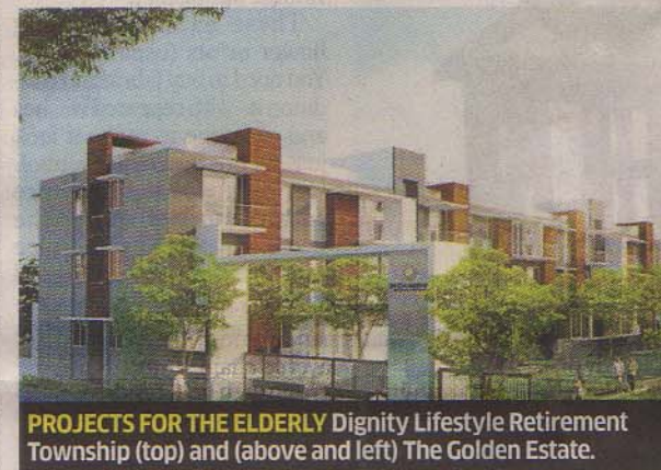
PROJECTS FOR THE ELDERLY Dignity Lifestyle Retirement Township (top) and (above and left) The Golden Estate.

of Indian local games are available. Then there are also Internet-browsing services, a well-stocked library of books and magazines, Health Club and Fitness Centre, and auditorium. Activities for physical well-being like fitness, yoga and meditation classes as well as spiritual discourses are part of